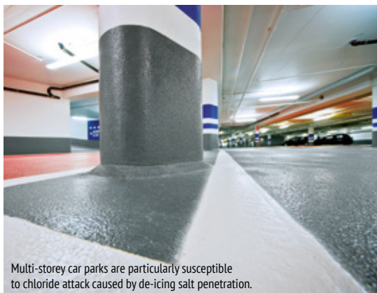
Multi-storey car parks are particularly susceptible to chloride attack caused by de-icing salt penetration.