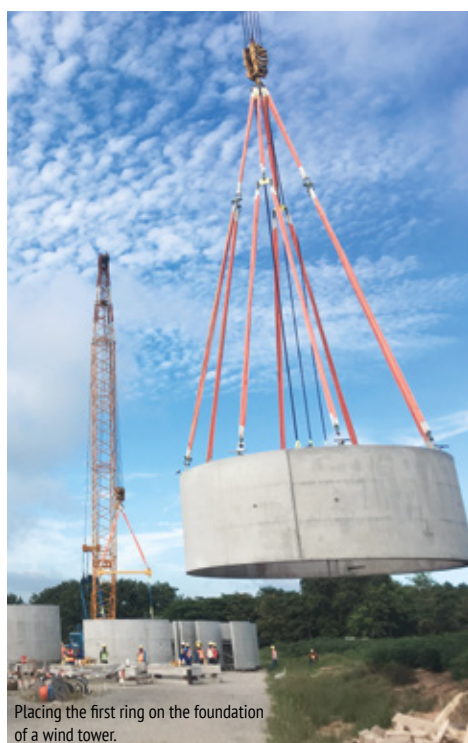
Placing the first ring on the foundation of a wind tower.

In the last 20 years, the technical development of wind power generation has mainly focused on the construction of ever larger turbines in order to achieve higher outputs per unit. By 2020, the average rotor diameter of new turbines in Germany had grown to 122 metres and the average hub height to 135 metres. But there was no stopping there: In order to achieve a high power yield even in areas with less wind, more and more so-called low-wind turbines have been erected in the recent past. Such units now have rotor diameters and hub heights of over 160 metres.