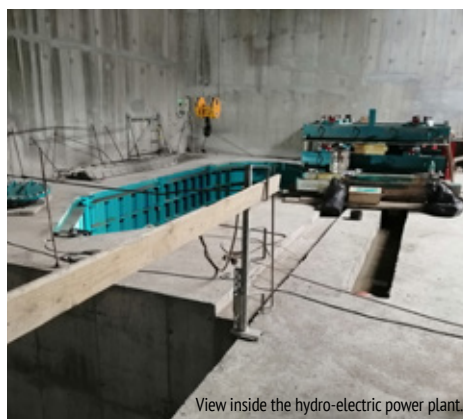
View inside the hydro-electric power plant.

By final completion in summer 2021, around 30,000 m 3 of concrete had been successfully installed, with MC's concrete admixtures ensuring smooth project progress throughout the three-year construction period, summer and winter alike.