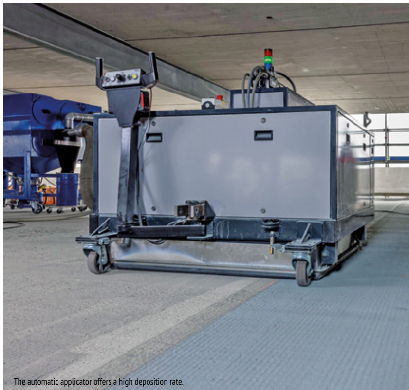
The automatic applicator offers a high deposition rate.