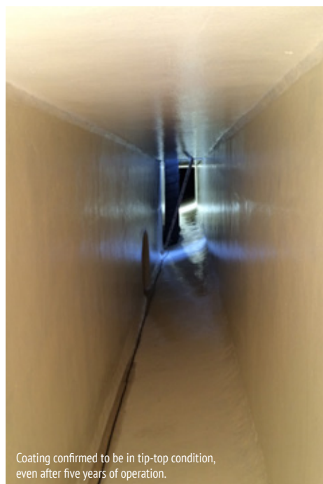
Coating confirmed to be in tip-top condition, even after five years of operation.

latter is characterised by very good resistance to organic acids, salt solutions and alkalis, as well as to biogenic sulphuric acid corrosion.