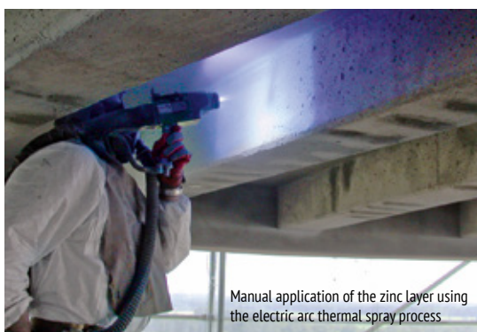
Manual application of the zinc layer using the electric arc thermal spray process