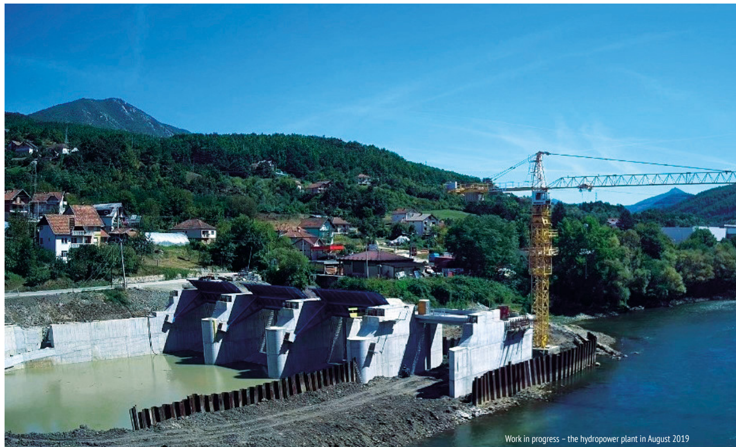
Work in progress – the hydropower plant in August 2019

Recently completed on the River Lim in south-western Serbia lies a small hydroelectric power plant designed to cover the electricity needs of the town of Priboj and its environs. Construction of the associated dam required the full range of MC's expertise in concrete technology.