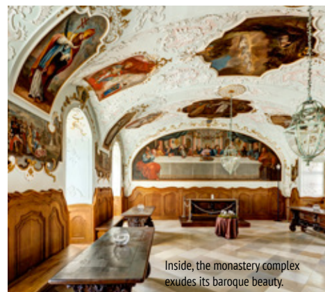
Inside, the monastery complex exudes its baroque beauty.

As a salt transport and moisture-regulating plaster, Exzellent STP enables masonry exposed to moisture and salts to permanently dry out through the progression of a natural process. The render system offers huge advantages in this respect due to its unique network of micro- and macro-pores. The moisture, together with the salts dissolved in it, is reliably and continuously transported out of the masonry to the render surface without destroying the coating structure. Further, the natural mineral render both prevents the formation of mould and ensures a pleasant interior climate. Since, for heritage preservation reasons, construction materials had to be used that resembled those of the original historic buildings – and in the 18th century there were no cementitious mortars or renders – the specialists at MC recommended application of cement-free Exzellent STP historic. This is based on NHL (natural hydraulic lime) and Roman lime and offers the perfect solution for the restoration of listed monuments.