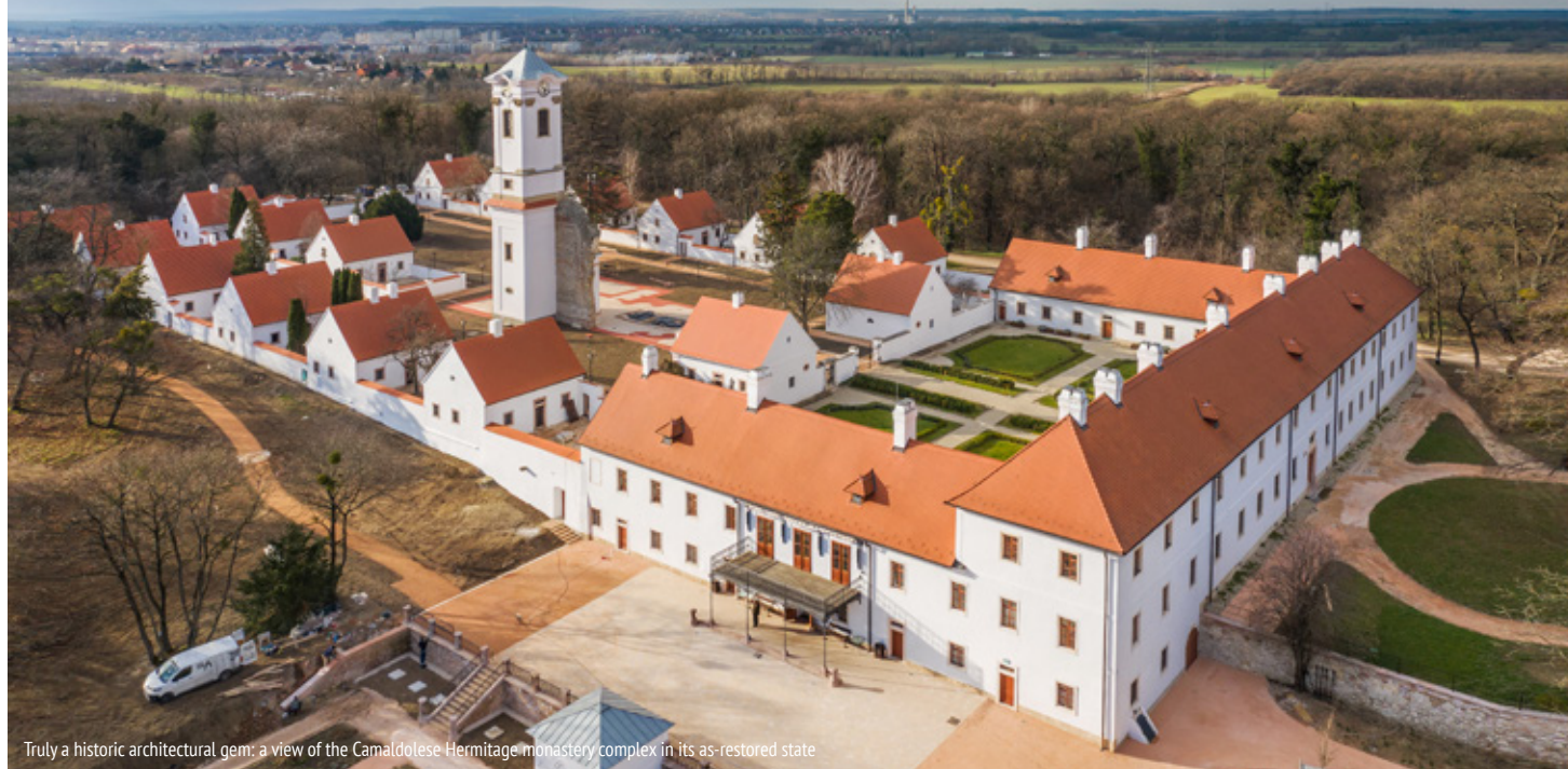
Truly a historic architectural gem: a view of the Camaldolese Hermitage monastery complex in its as-restored state

Timeless, natural beauty in traditional splendour